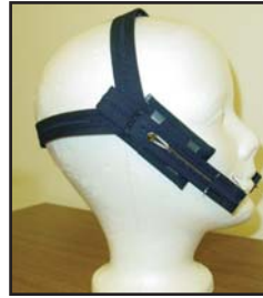
The "Klarris" Headgear